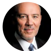
Stéphane Richard CEO Orange (FR)