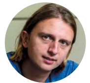
Nikolay Storonsky CEO Revolut (UK)