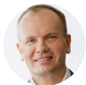
Markus Braun CEO Wirecard (DE)