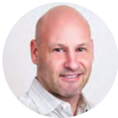
Joseph Lubin Co-founder Ethereum (US)