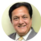
Rana Kapoor CEO YES BANK (IN)