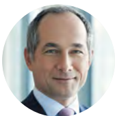
Frédéric Oudéa CEO Société Générale (FR)