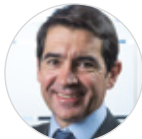
Carlos Torres Vila CEO BBVA (ES)