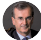
F. Villeroy de Galhau Governor Banque de France (FR)