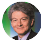
Thierry Breton Chairman Atos (FR)