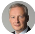
Bruno Le Maire Minister of Economy & Finance (France)