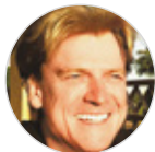
Patrick Byrne CEO Overstock.com (US)