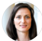
Mariya Gabriel Digital Economy & Society European Commission (BE)