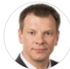
Vilius Šapoka Minister of Finance (Lithuania)