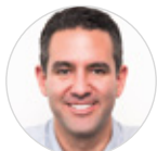
David Vélez CEO Nubank (BR)