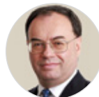
Andrew Bailey CEO Financial Conduct Authority (UK)