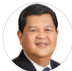
Nestor Espenilla Governor Bangko Sentral ng Pilipinas (PH)