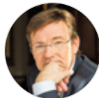
Johan Van Overtveldt Minister of Finance (Belgium)