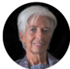
Christine Lagarde Managing Director International Monetary Fund (US)