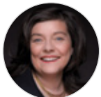
Anne Boden CEO Starling Bank (UK)