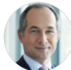
Frédéric Oudéa CEO Société Générale (FR)